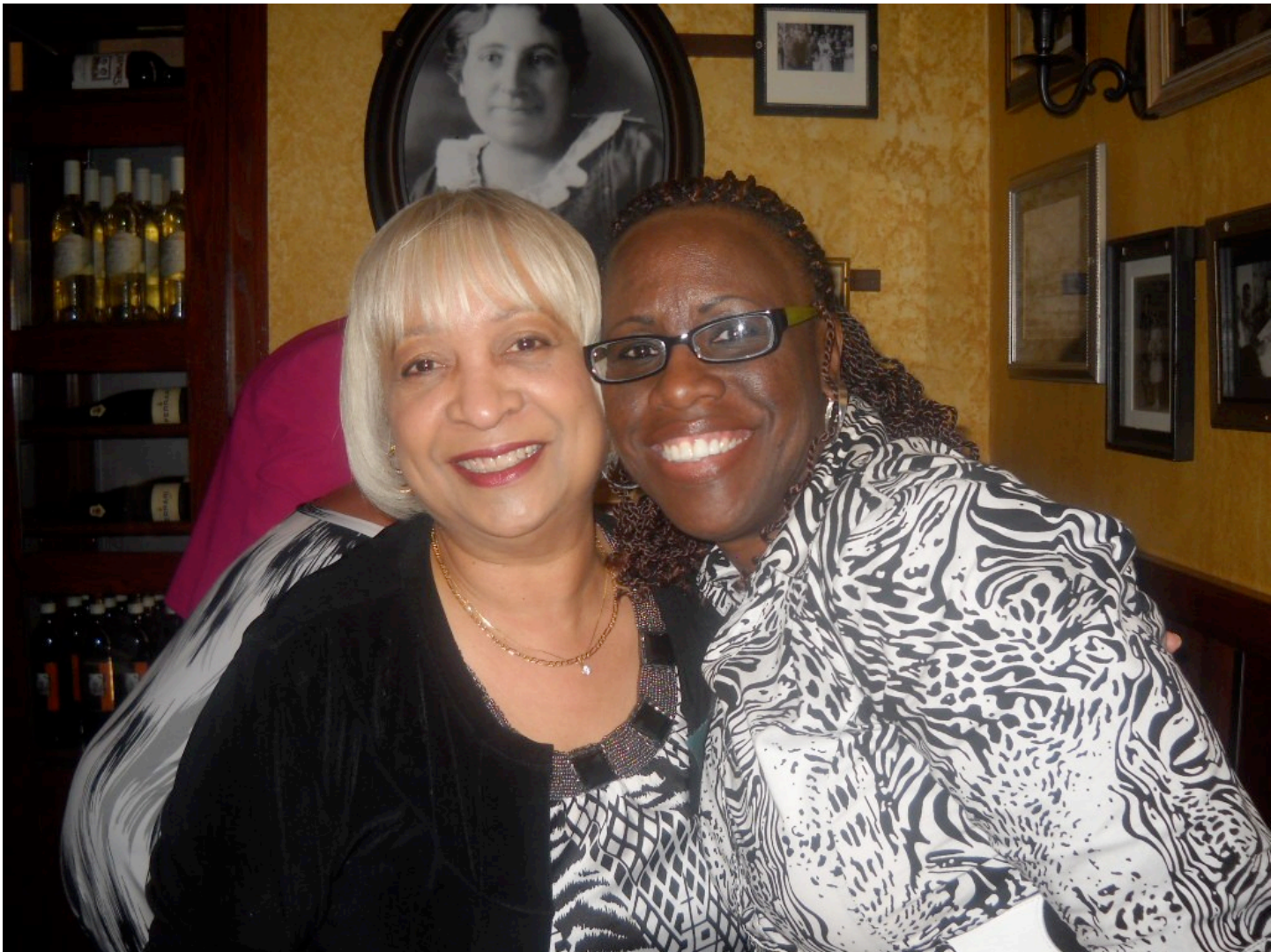
EWI-DC held its June meeting at Carmine's restaurant in Washington, DC. We enjoyed a delicious family style dinner, wine, dessert, and fellowship.